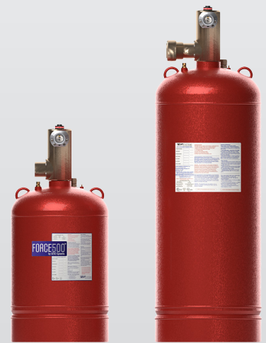
500 PSI (322 Lb.)